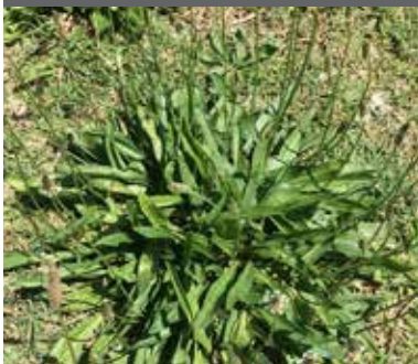
Plantain – Plantago lanceolata