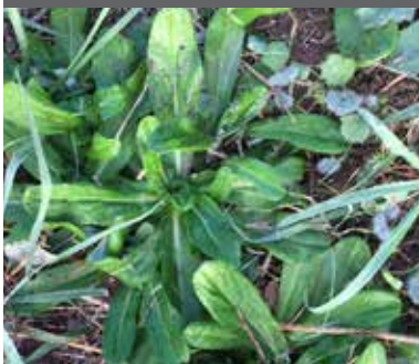
Cudweed – Gamochaeta spp.