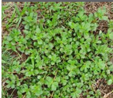
Pigweed – Portulaca oleracea