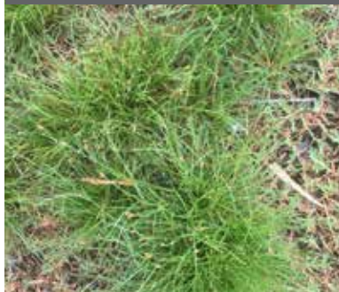
Toad Rush – Juncus spp.