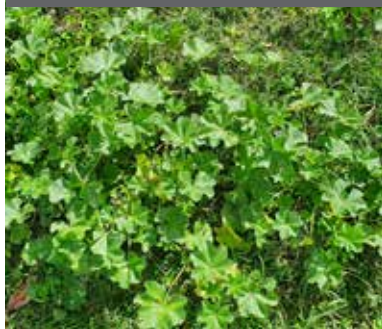
Mallow – Malva parviflora