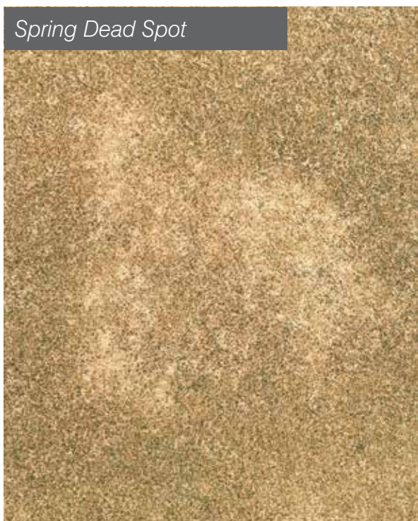
Spring Dead Spot

It is classified as a DMI inhibitor as it stops the demethylation step in the biosynthesis of ergosterol, a vital component of cell walls in many fungi.