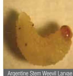
Argentine Stem Weevil Larvae