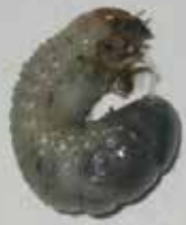
African Black Beetle Larvae