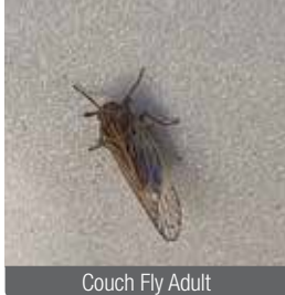
Couch Fly Adult