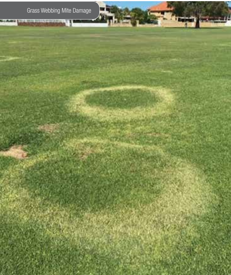
Grass Webbing Mite Damage