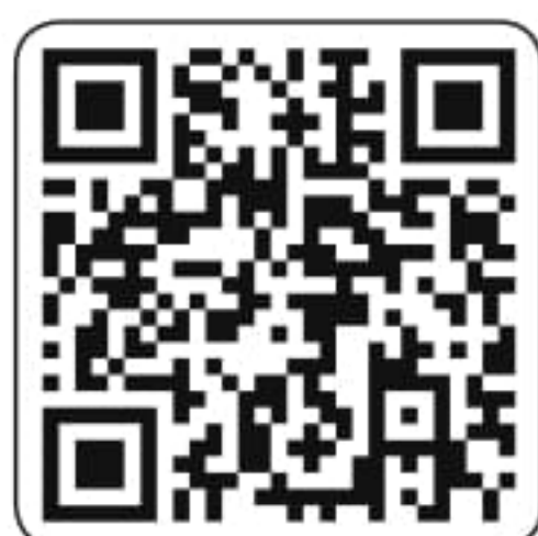
MSDS QR CODE