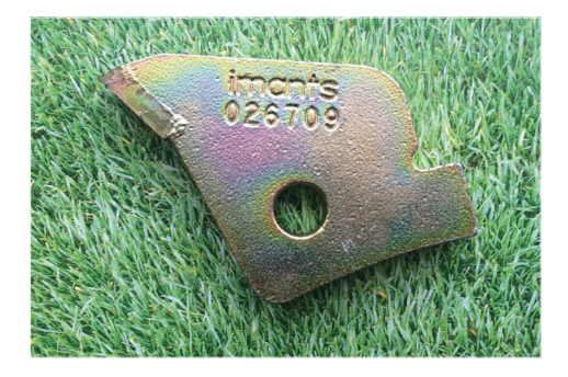
2012 / 2013 saw the introduction of 2 new rotors for the KORO<sup>®</sup> FTM<sup>®</sup>; UNIVERSE<sup>®</sup> and TERRAPLANE<sup>®</sup>.

10mm tungsten tipped blades in 4 spiral UNIVERSE<sup>®</sup> rotor configuration