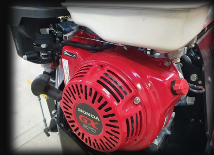
STTrac 700-26: 8.5 HP HONDA engine STTrac 720-26: 12,5 HP HONDA engine

For accessibility and stability the STTrac's rear wheels can be set in multiple configurations. Behind, for narrow access situations, Left or right side settings for edging applications and the standard wide position for optimal stability and short turning radius. Or choose a combination of both with one wheel behind and one wheel beside the STTrac .