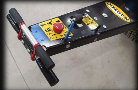
Easy accessible controls