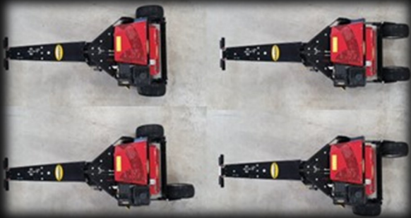
Multiple rear wheel positions