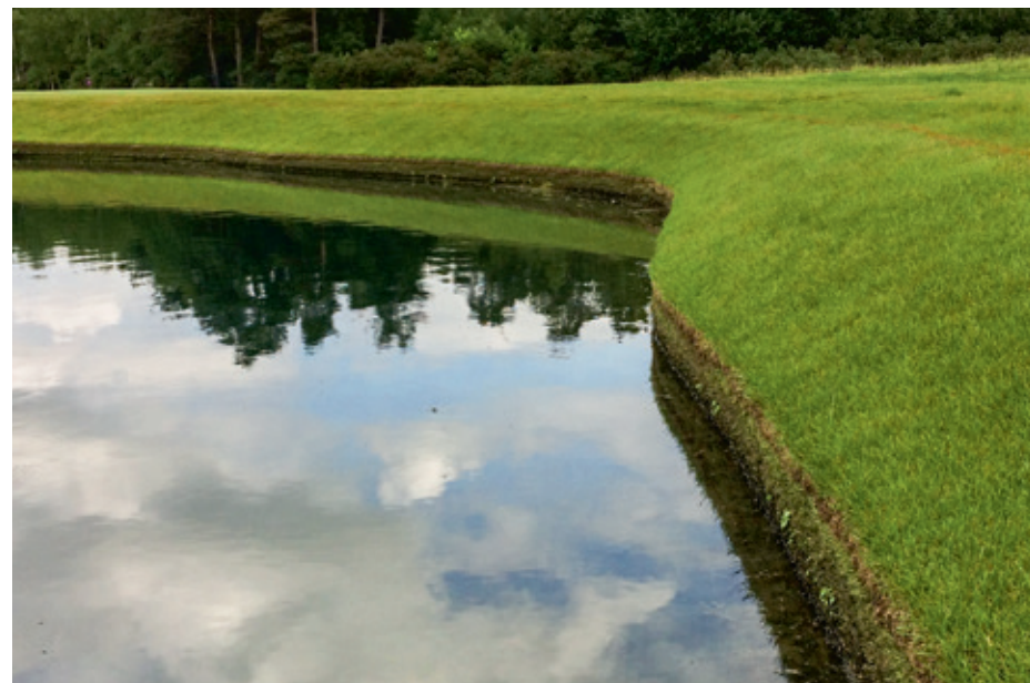
With the AquaEdge lake liner, as seen here on the sixth hole at Queenwood, a debate around whether a ball is in or out of a hazard is no longer necessary

AquaEdge is a civil engineering process which includes an initial investigation, design and specification work, planning, the supply of the various components and installation.