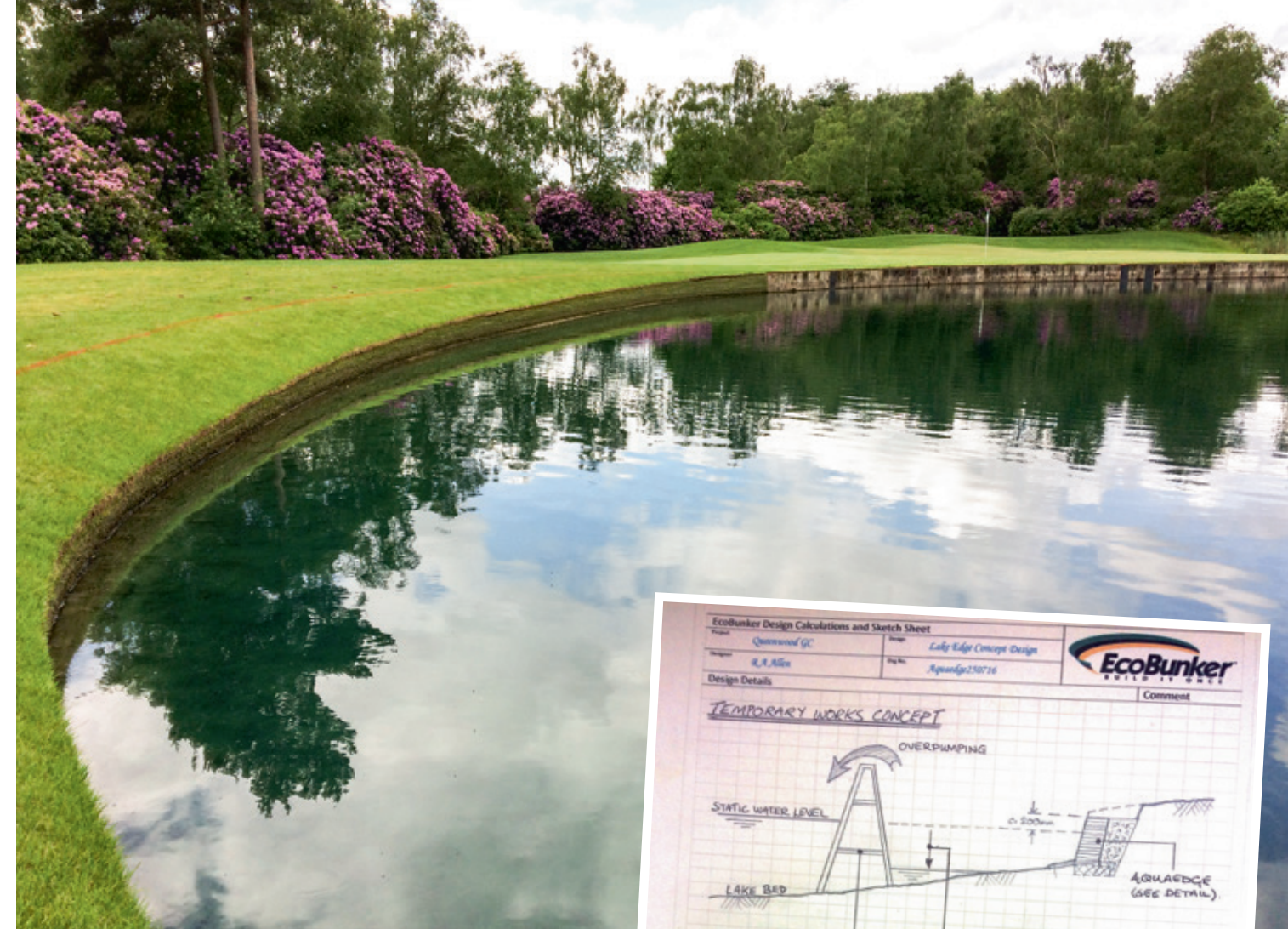
Richard Allen’s plans for the lake liner and be seen in practice here on the fifth hole at Queenwood

AquaEdge offers the opportunity to have consistent and cleanly defined water margins, close to areas in play, that look entirely natural. The installation work is very fast and involves minimal disruption when compared with more traditional retaining