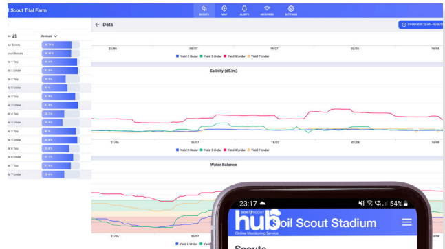
Screenshots from Soil Scout Monitoring Service indicating the individual sensor data.

When direct transmission to the Base Station is not possible because of distance or topographical barriers, one or more solar powered Echo Repeaters can be used to forward the signal. Range over 5km line of sight.